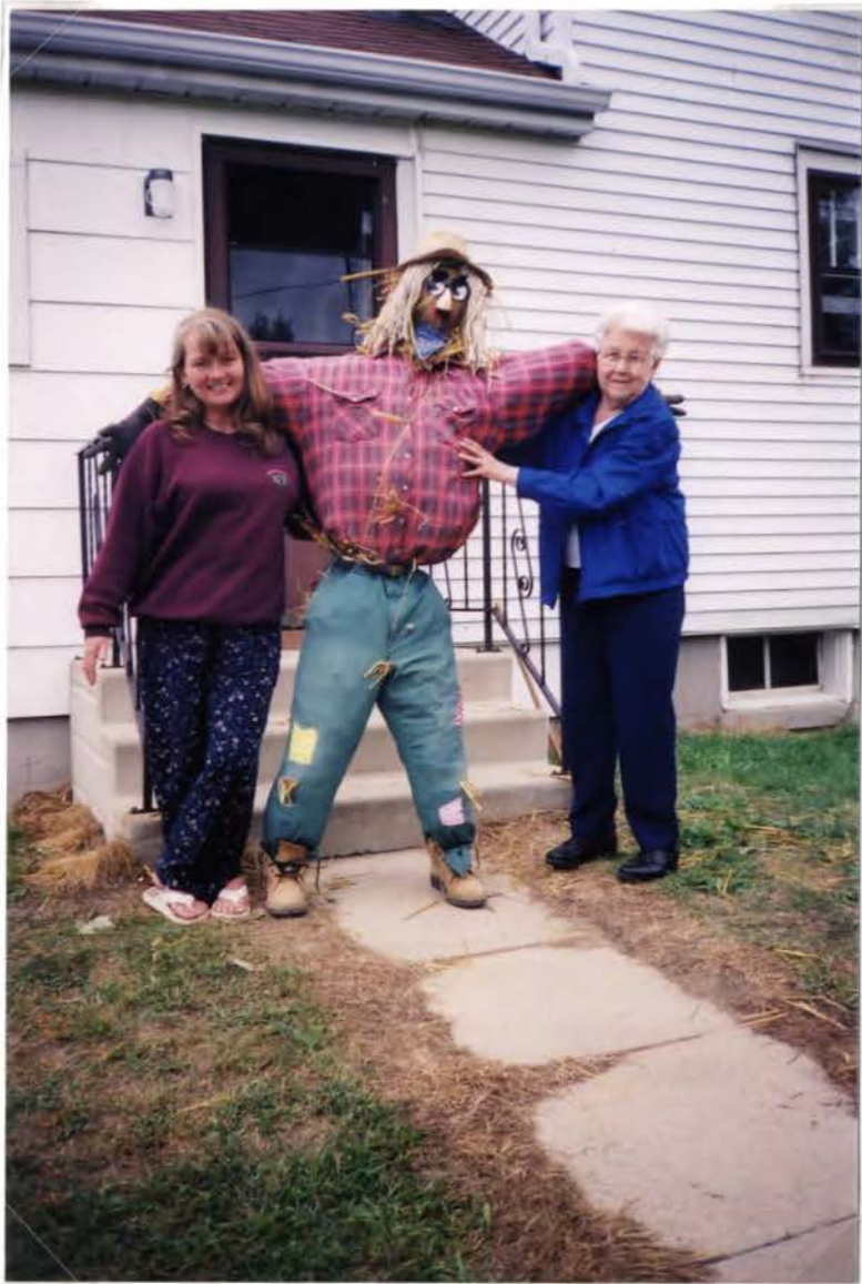
"Best Scarecrow" Entry