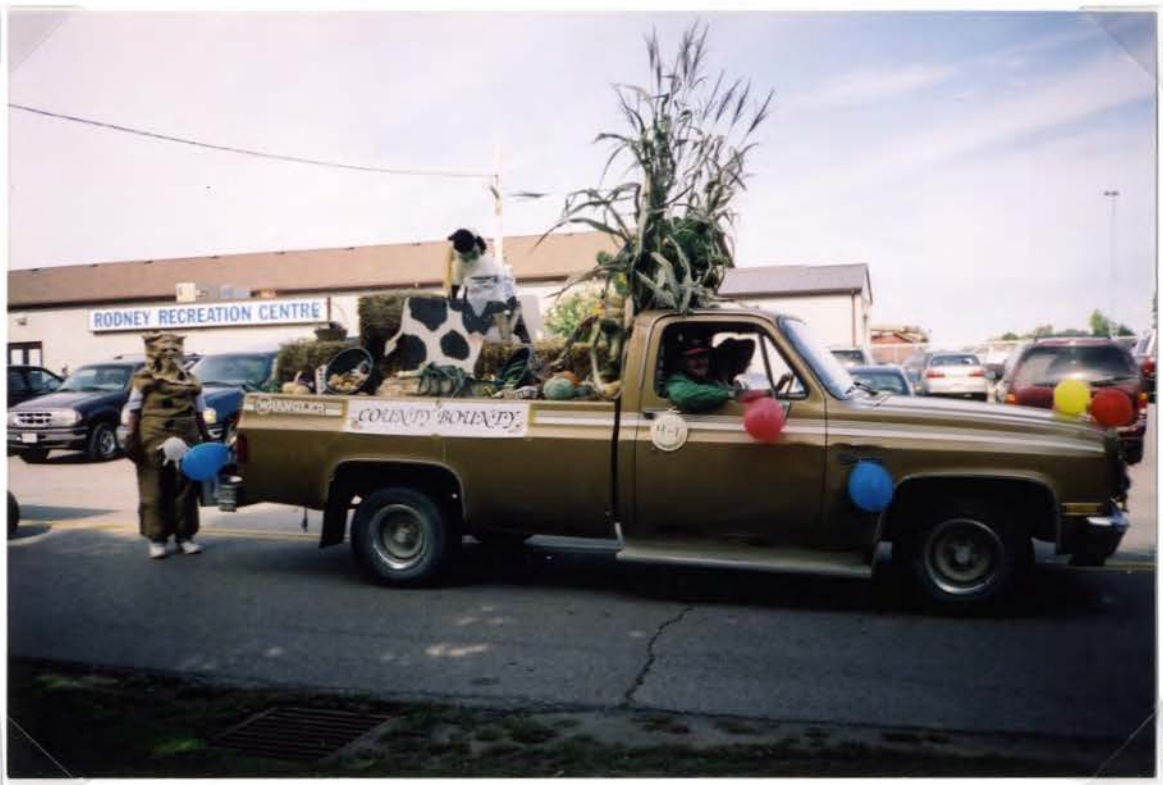
Country Bounty - Crinan W.I. Float at Rodney Fair Sept. 2001