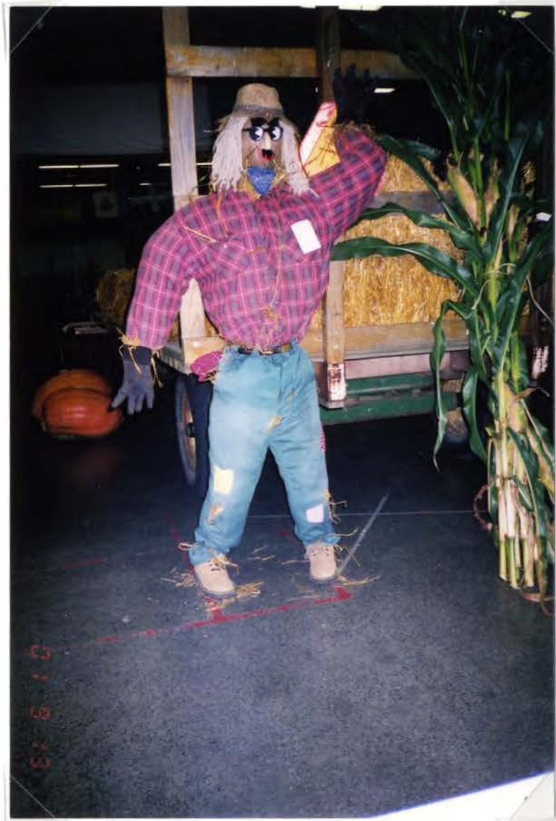
"Second Prize" at the Fair.