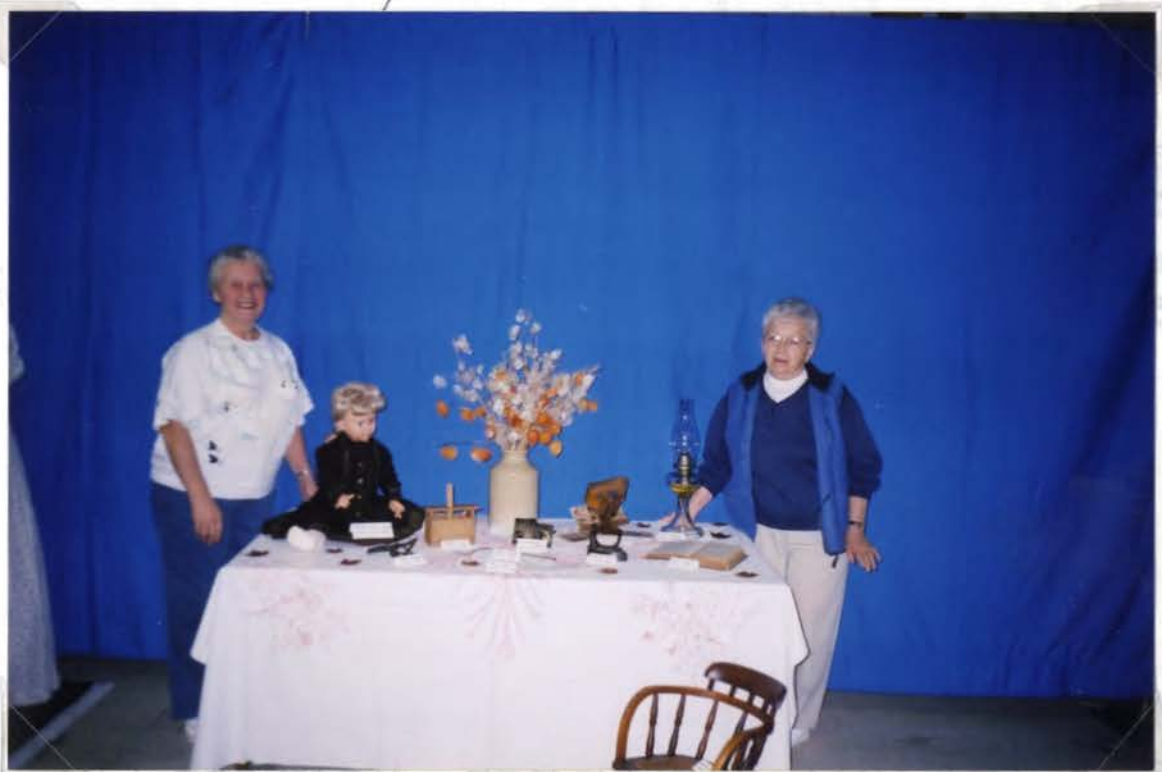
Celebrating Elgin's Past.