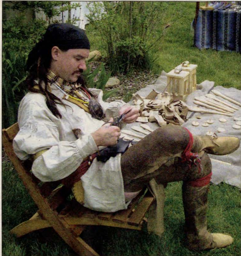
A leather crafter dressed in period costume joined many exhibitors and demonstrators Friday at the Backus-Page House at Tyrconnell. The Tyrconnell Heritage Society hosted an education day for students across the region and on Saturday and Sunday, hosted battlefield re-enactments as part of events celebrating the 200th anniversary of the Talbot Settlement.