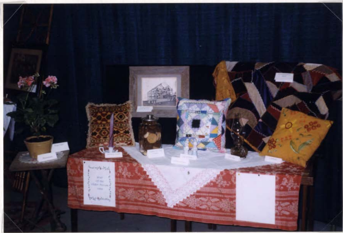
Wallacetown Fair Display 1998 "YEAR OF THE OLDER PERSON."